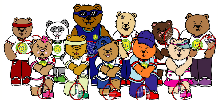
Johnny Bear Amanda Panda HEAD TED Chloe Bear Tim Bear Donny Bear Charlie Bear Boris Bear Molly Bear Anna Bear Grizzly Wizzly

Teddy Tennis will develop each Cub Cadet's athletic capabilities, improve their coordination, grow their confidence, enhance their communication skills and encourage them to come back for more ..... FUN!!!