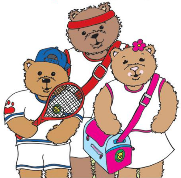
Danny, Johnny Mac and Chloe Bear

The bears (known as Cub Cadets ) play an important role at the Teddy Tennis Academy in setting a fine example of behaviour, what to eat and drink as well as being very good at playing Teddy Tennis. They act as excellent role models.