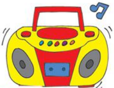
Teddy Tennis CD Player

Teddy Tennis is a fantastic new approach for teaching young children aged 3, 4 and 5 years to play tennis; it is FUN to do and it is loved by everyone. It works by using pop music and pictures... but its not just any old music nor any old pictures!